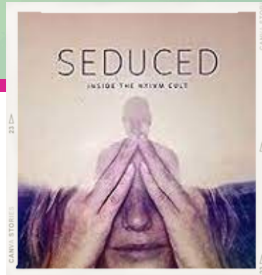
Seduced: Inside the NXIVM Cult