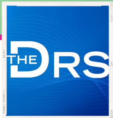
Cult Warning Signs